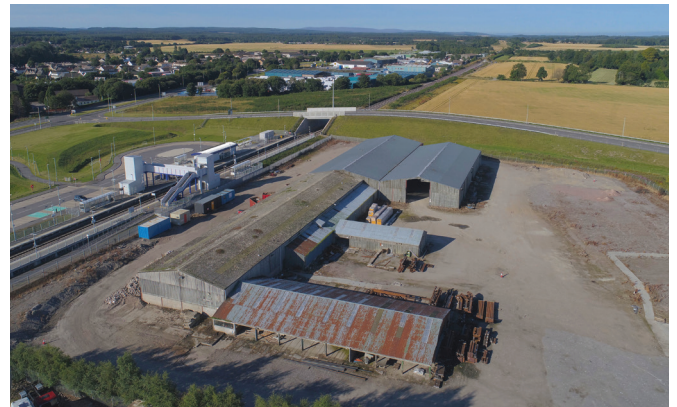
The site at Waterford before the renovation began

AJ Engineering currently sits on a total of 2.25 acres at its Greshop Industrial Estate sites, whilst the sister company NEWCo comprises a workshop within 2.7 acres.